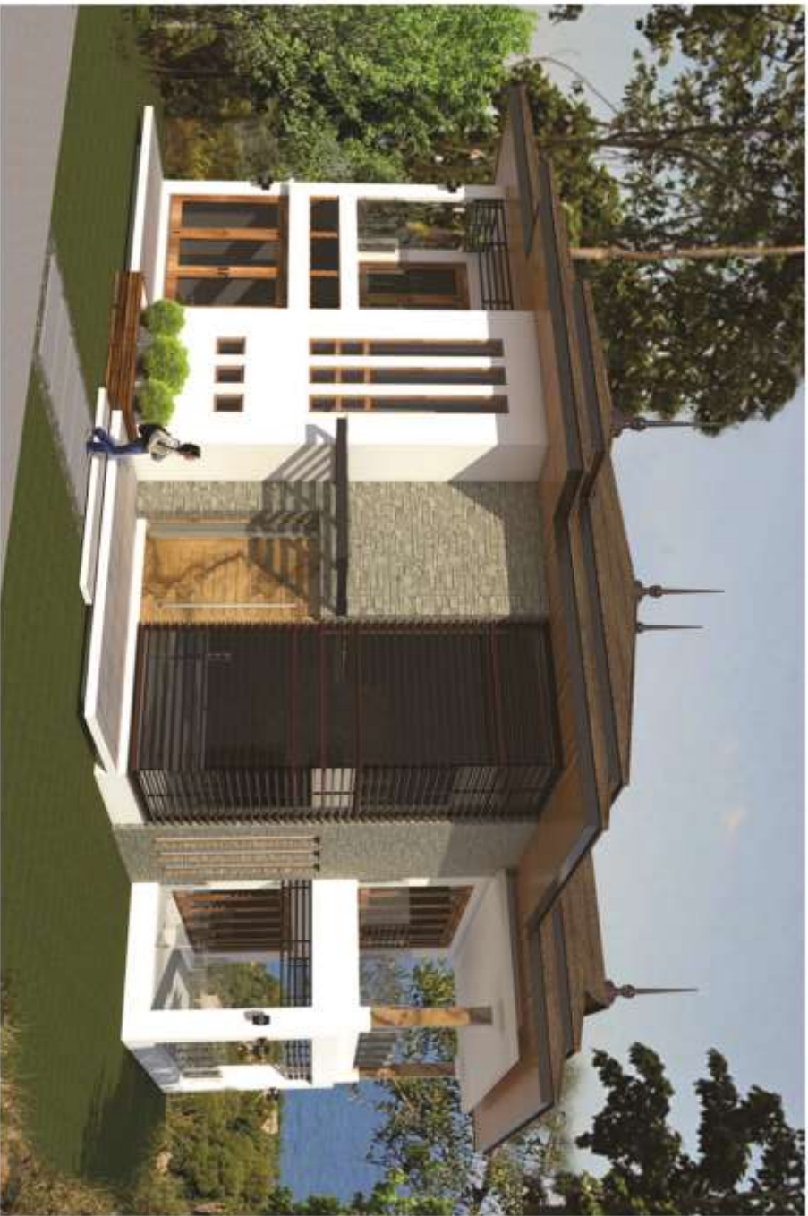
TWO - STOREY MODEL - TWO