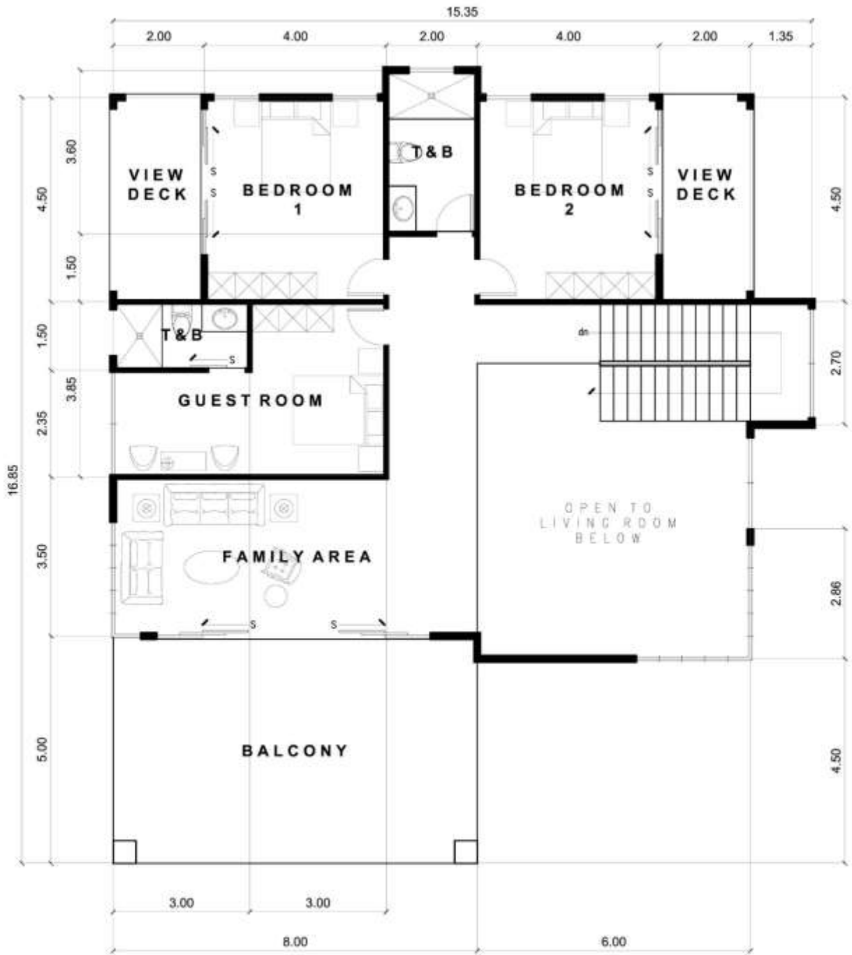
TWO- STOREY MODEL ONE SECOND FLOOR PLAN