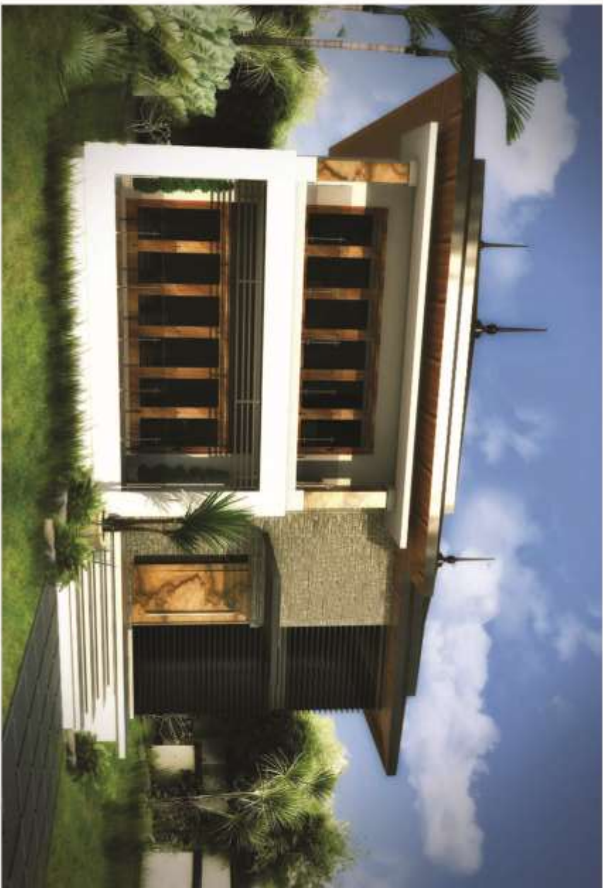
TWO - STOREY MODEL - ONE