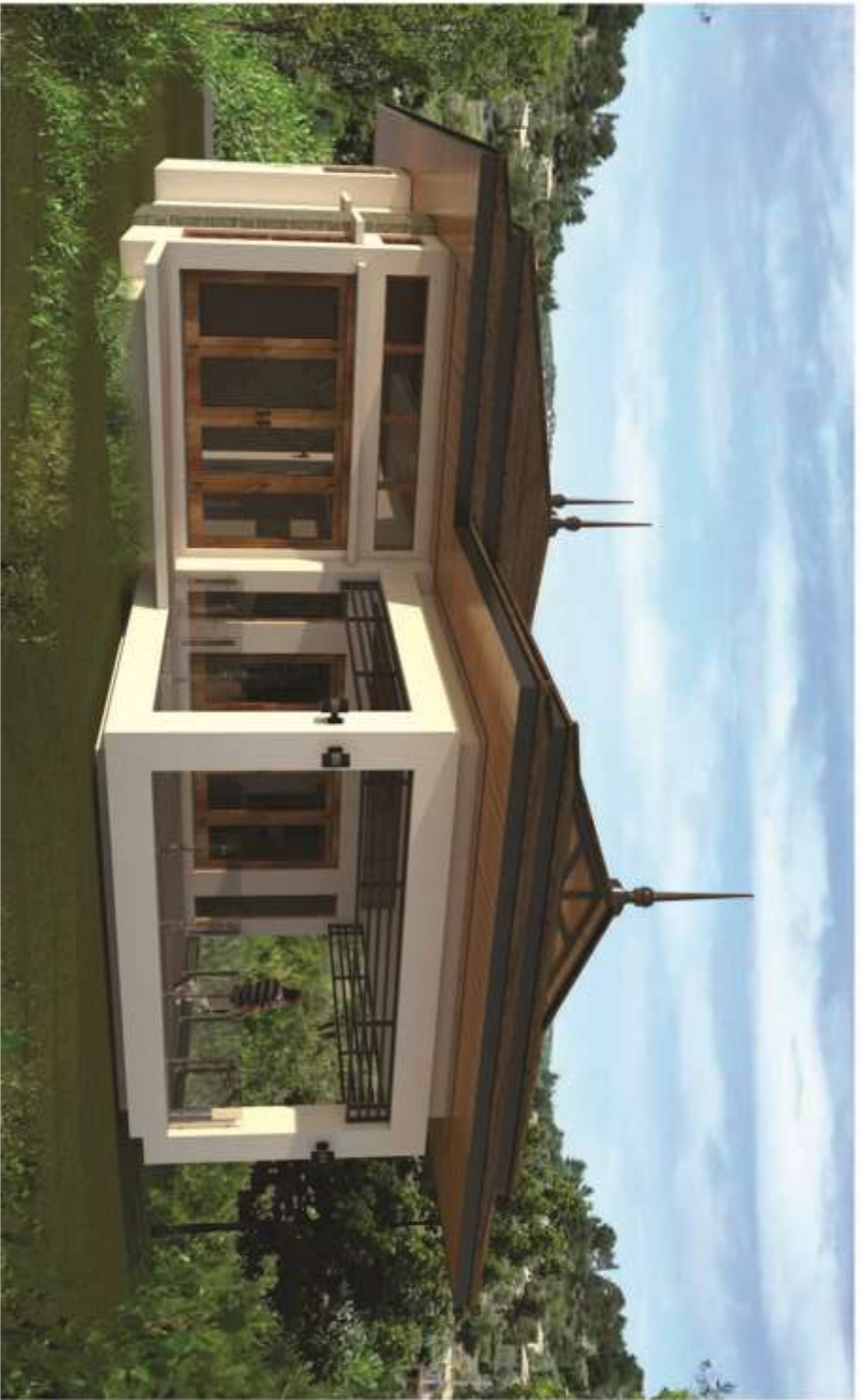
BUNGALOW MODEL - FOUR