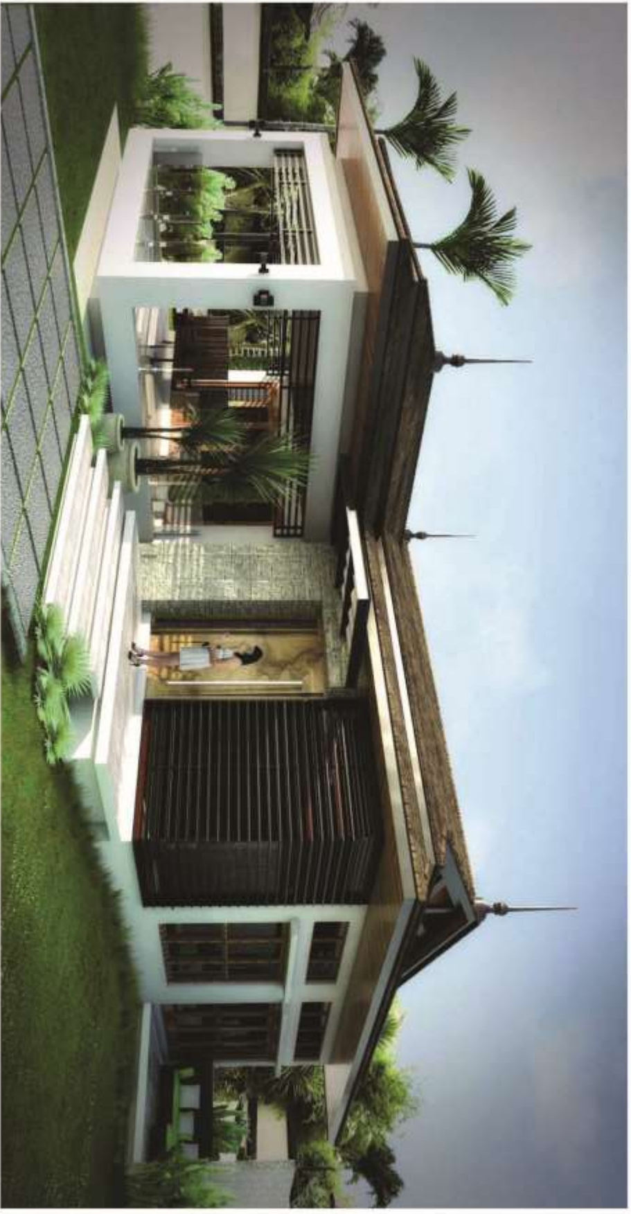
BUNGALOW MODEL - THREE