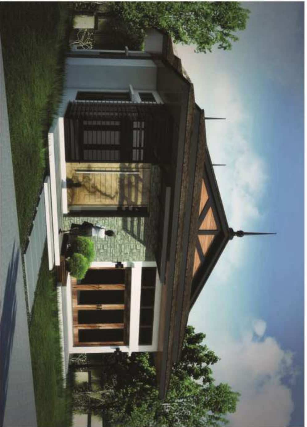
BUNGALOW MODEL - TWO